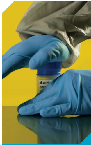
Press down on cap until it clicks