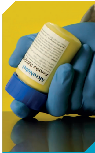
Shake well to mix component